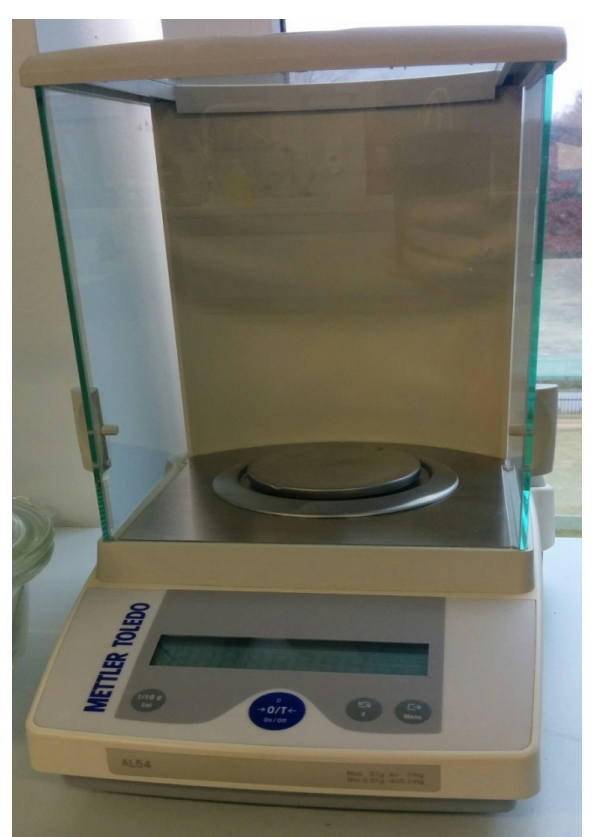
Figure 2. Analytical scale.

Illustrative material (figure, table, quote, etc.) is not consecutively presented without interim text.